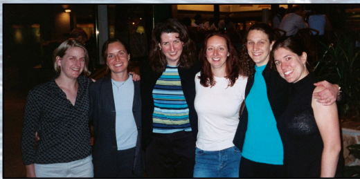
Founding ESWN members in 2002

Recognizing the benefits of a peer network, the group began exchanging advice over email, adding friends and colleagues, who in turn added their friends and colleagues. As the group grew, the National Center for Atmospheric Research sponsored a listserv. More than 10 years later and with generous support from the National Science Foundation and AGU, ESWN hosts a web center for our members to establish connections for peer-mentoring and scientific collaborations, organize networking events, and share resources and information. ESWN works to broaden the participation of historically underrepresented groups in the geosciences and build a more inclusive society and scientific enterprise. To learn more about ESWN's recent activities, check out our news page: http://eswnonline.org/eswn-in-the-news/